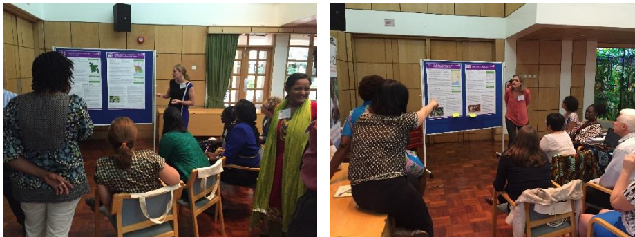
Gallery walk: Presenting posters to fellow participants

The afternoon session started with a gallery walk where each project team presented a poster outlining their project to fellow participants ( link to posters ).