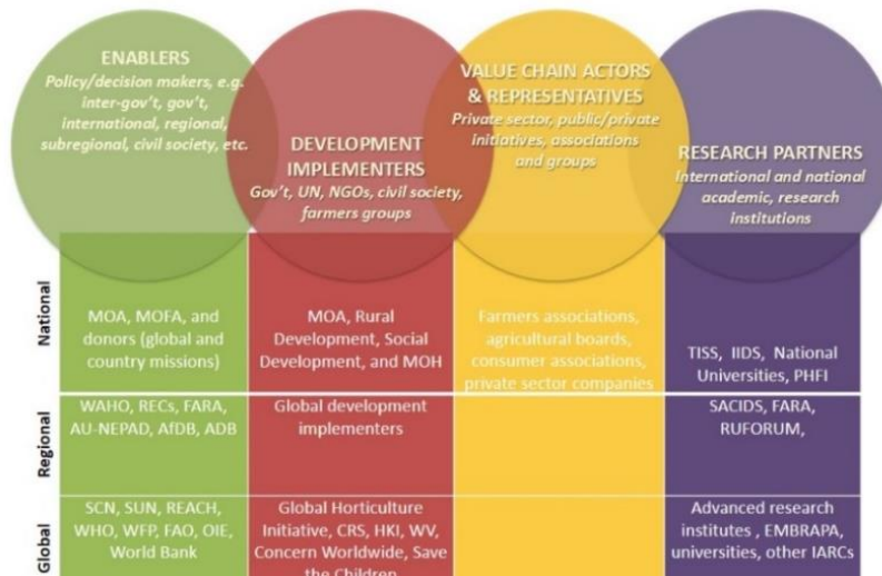
Figure 2. Strategic partners in A4NH impact pathways

The four A4NH partnership categories ( Figure 2 ) have been consistently maintained. The A4NH partnership strategy is based on the reality that A4NH must partner with and add value to broader agriculture development efforts and link these to nutrition and health initiatives through the impact pathways of value chains, programs and policies. Capacity sharing and development is embedded in the partnership strategy. A4NH works with other research and capacity development organizations